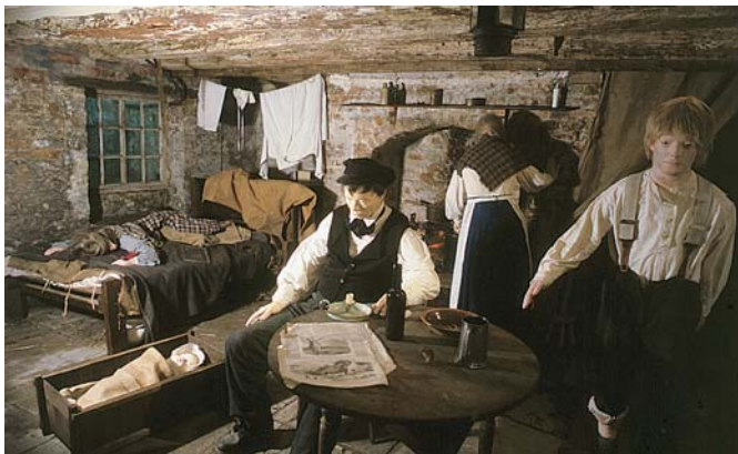
Octavia Hill Birthplace House, Wisbech

Octavia Hill Birthplace House (South Brink) - life and work of social reformer and co-founder of The National Trust. Open Mar-Oct. Admission charge. (01945) 476358.