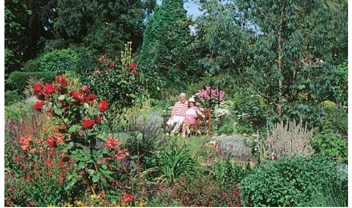
Elgood's Brewery and Garden

C Elgood's Brewery and Garden - classic Georgian brewery dominating the southern end of North Brink. It has stood almost unchanged for more than 200 years. The present owners, the Elgood family, mashed their first brew here in 1878 and have continued to produce fine traditional ales. Guided tours and tastings. Adjacent is a 4 acre garden with unusual trees and maze. Open May-Sept. Admission charge. (01945) 583160. ✖️