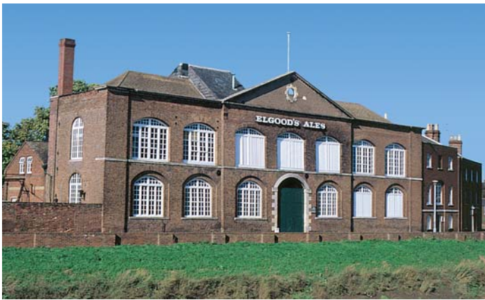
Elgood's Brewery and Garden

6 Turn R in front of the bungalow along Rummers Lane (NS).