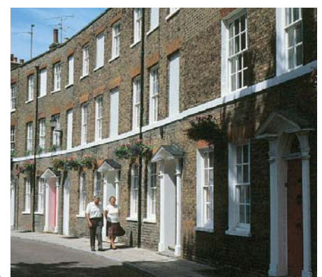
The Crescent, Wisbech