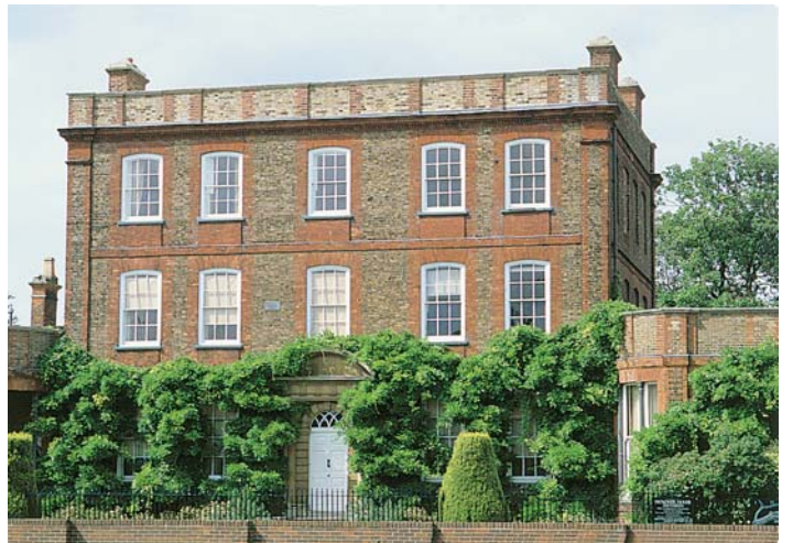
Peckover House and Garden, Wisbech

22 Bear L back across the bridge to the memorial. You may wish to dismount and walk the final stretch using the pedestrian crossing.