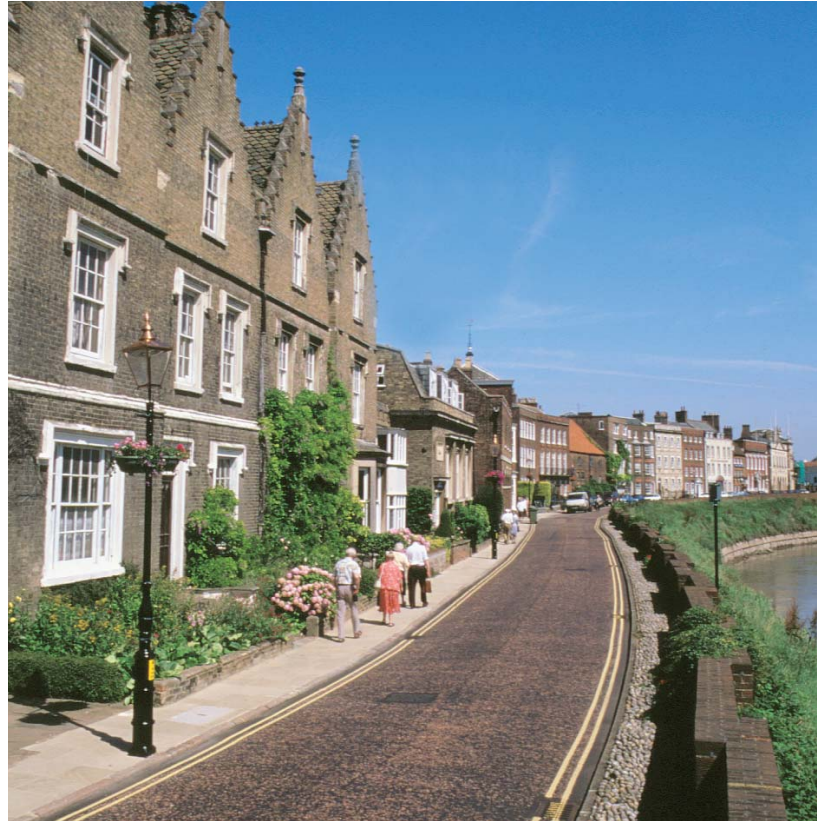
North Brink, Wisbech

This cycle ride starts from the busy market town of Wisbech, the capital of the surrounding Fens. From here the route heads west into rich farmland, past waterways, ancient sea banks and tiny Fenland villages, which are surrounded by hundreds of acres of orchards. In springtime these are enriched with the colour and scent of blossom, and in autumn, by delicious fruit. Along this route you can wander amongst the 100 year old apple trees in an old orchard, discover the treasures of ancient churches and taste the real ales at a Georgian brewery.