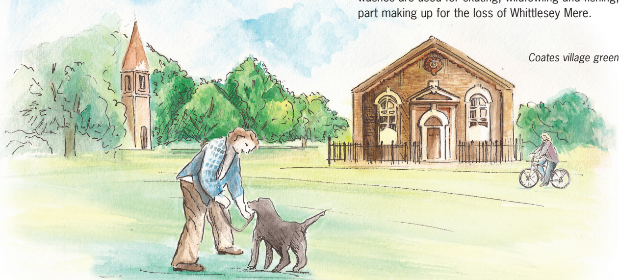
Coates village green

Lying to the north of Whittlesey, the Nene Washes comprise a large area of open land created as a result of the drainage of the surrounding fenland for agriculture in the 17th and 18th centuries. The land serves as the flood storage area for the River Nene. The combination of grassland and the wetness make the Washes a great place for wildlife. Important numbers of wildfowl winter here including Bewick swans from Russia and Whooper swans from Iceland. The Washes are some of the best floodplain meadows left in England and support a significant proportion of the country's nesting black-tailed godwit and snipe. In addition to farming and wildlife, the washes are used for skating, wildfowling and fishing, in part making up for the loss of Whittlesey Mere.